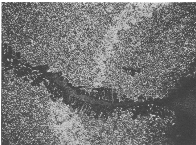
Figure 1 Interface between two 800 \mu\text{m} diameter spherical particles of lead, showing, at the interface, a region which has been melted ( \times 90 ).

produce high densities, but the properties are not significantly different from those of statically pressed material [5].